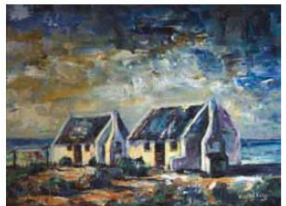
Extra - Kathy Kay - Cape Cottages